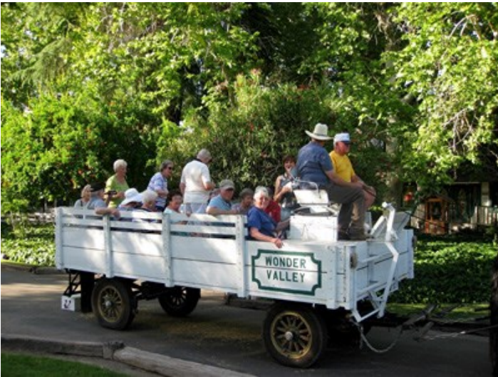
Wonder Valley Resort - Hayride