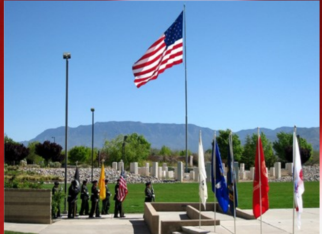
47th New Mexico Regiment Color Guard Posting Colors

Day is done, gone the sun, From the lake, from the hill, From the sky. All is well, safely rest, God is nigh.