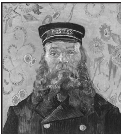
The Barnes Collection The Postman Vincent Van Gogh, 1889

We get acquainted with Philadelphia on a guided tour of all of the historical sites including visits to Franklin Court and Christ Church. Then we visit the Barnes Collection. It moved in 2012 from Dr. Barnes' home in the suburbs to a stunning new building in Fairmount Park and quickly became one of the most celebrated museums in the country. It holds the finest collection of Post-Impressionist art with works by Renoir, Cézanne, Van Gogh, Matisse, Picasso, Rousseau, Modigliani, etc. Can you imagine 181 Renoirs?