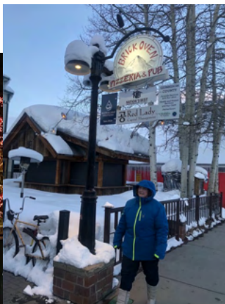
Cr Butte Brick Oven Restaurant