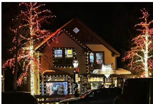
Breckenridge Town Lights