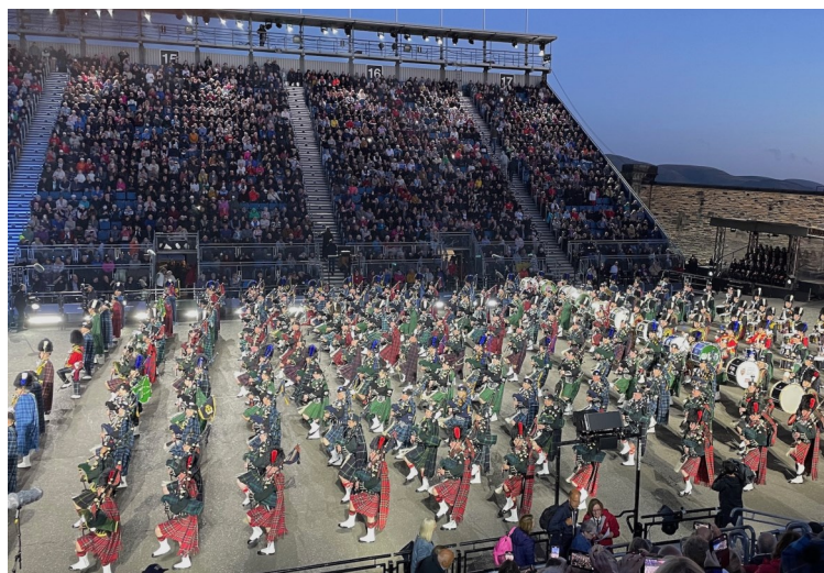
Edinburgh Military Tattoo— Bagpipers