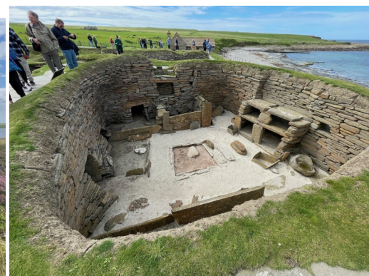
Stomness (Orkney Islands)—Skara Brae