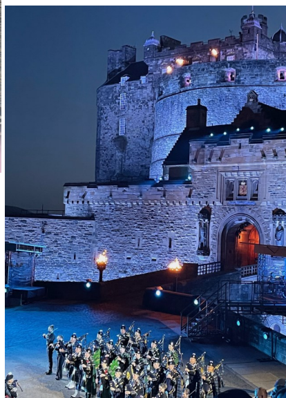
Edinburgh Military Tattoo—Castle—