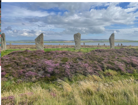
Stomness (Orkney Islands)—Ring of Brodgar— Heather & Sea