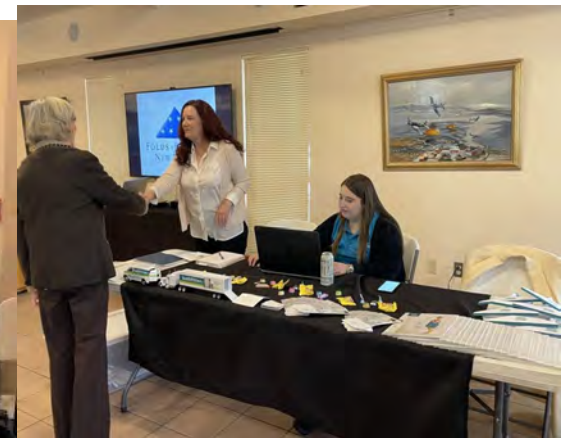
BathFitters Representatives—Items for Sale