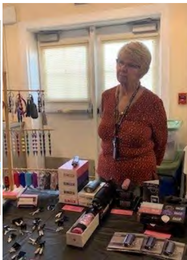
Defense Items for Sale