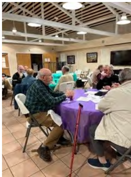
Attendees enjoying a meal of sliders and a variety of desserts