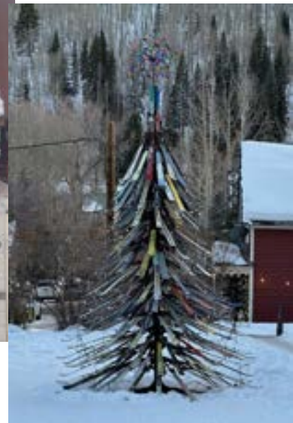
Telluride's Ski Tree