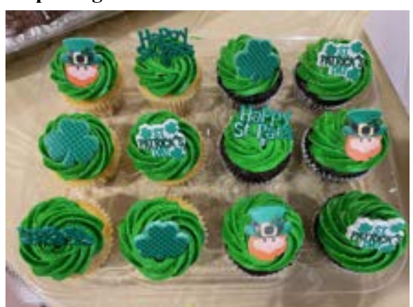
St. Patrick Day Cupcakes