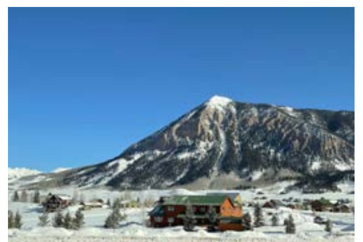
Crested Butte Mountain & Home