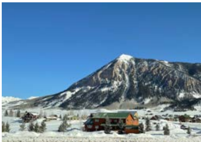
Crested Butte Mountain & Home