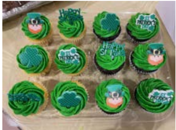
St. Patrick Day Cupcakes