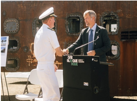
ADM Stuart Munsch and Mayor Tim Keller

The Mayor of Albuquerque, Tim Keller, held a press conference on September 9th, 2024, and announced that the sail and fairwater planes of the USS Albuquerque (SSN-706) will be mounted in the "Duck Pond" at Tingley Beach in Albuquerque, NM. The mounting design will simulate the USS Albuquerque surfacing in the middle of the pond. The announcement coincided with the start of Navy Week in New Mexico, and was headlined by Admiral Stuart Munsch, a previous captain of the USS Albuquerque (2002-2005).