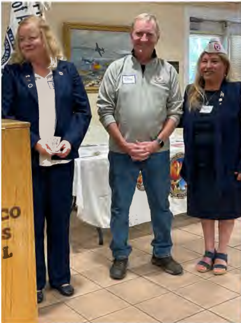
Donation to Blue Star Mothers

We are pleased to show photos of our donation recipients at our successful October Annual Meeting: