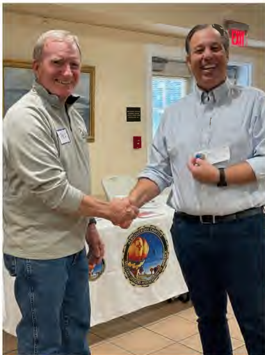
Donation to Veterans Integration Center