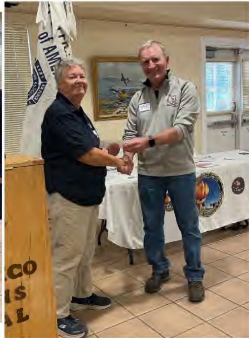
Donation to Honor Flight