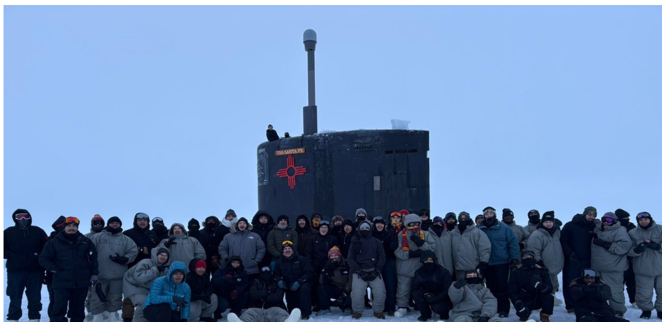
Image 2: Crew of USS Santa Fe (SSN-763) on ice in the Beaufort Sea